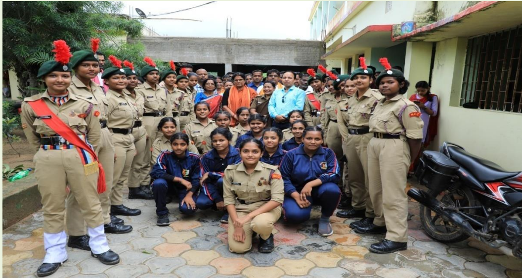
COLLEGE FOUNDATION DAY