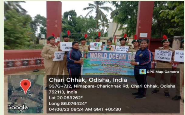
WORLD OCEAN DAY