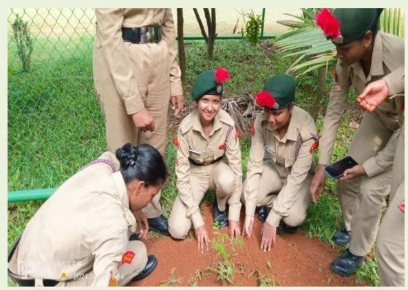
TREE PLANTATION IN CAMP