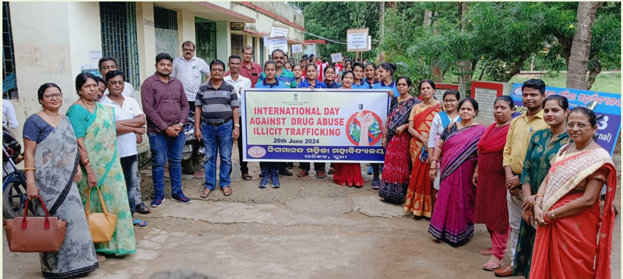
INTERNATIONAL DAY AGAINST DRUG ABUSE ILLICIT TRAFFIVKING